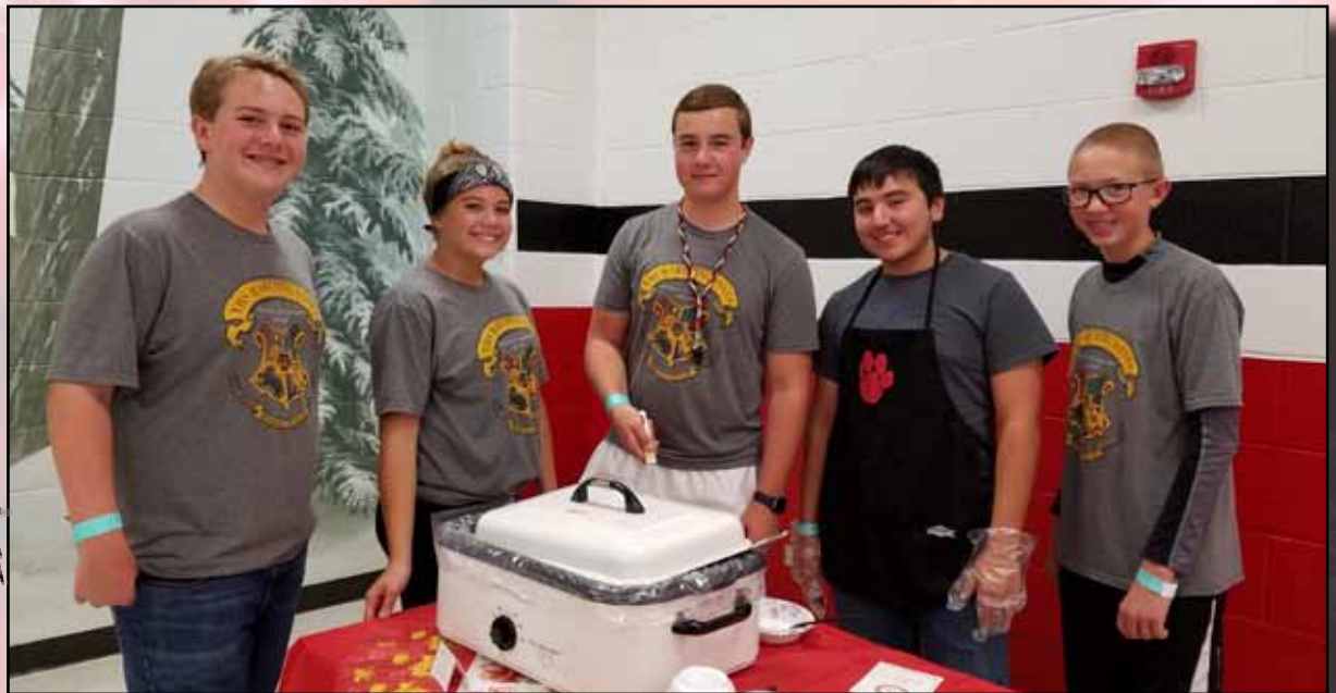
YHS Band students serving chili at the 2016 Yorkville Music Booster's 9th annual Red Paw Chili Supper.