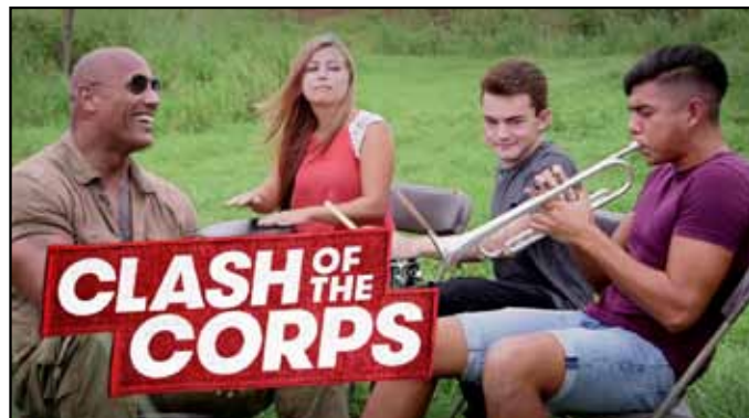
Dwayne Johnson and 'Clash of the Corps' Blue Devils break it down in Hawaii.